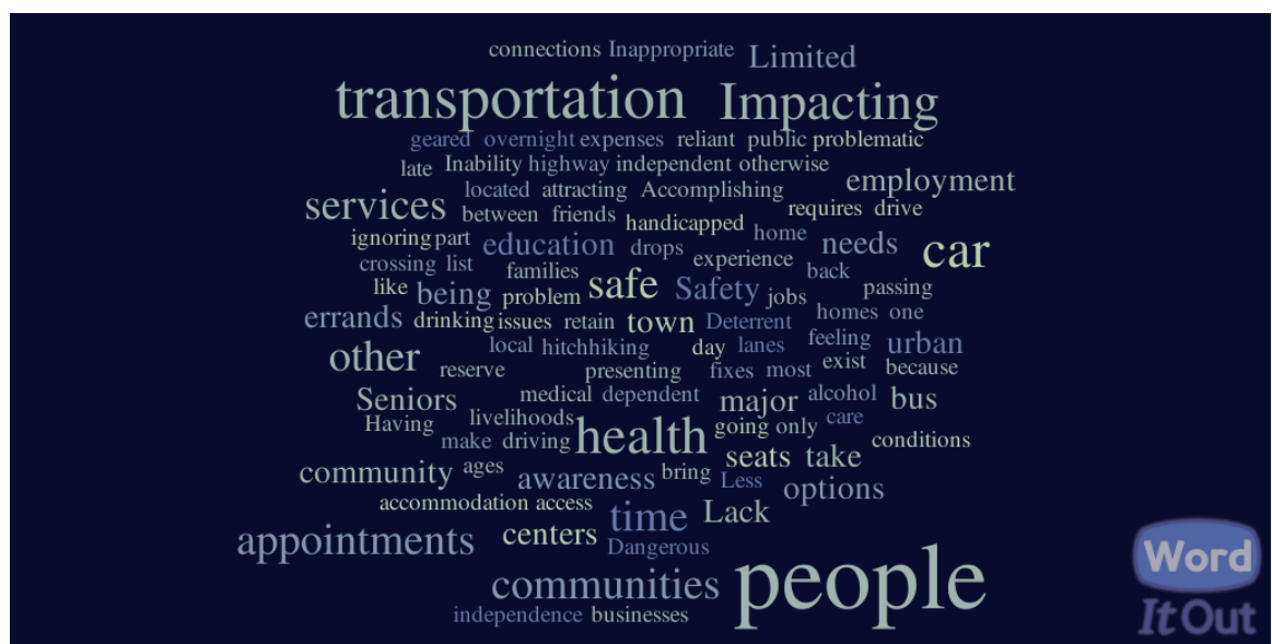
Word cloud of responses to 'Inaccessible transportation is...' at community engagements

Young families are moving away from rural communities within the region so that their kids can attend school, participate in recreational activities, and have more options overall. That out-migration has led smaller populations in those communities, further exacerbating the isolation and lack of socialization addressed in the first study question. Some First Nations communities have less than 20 full time residents remaining.